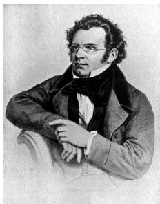
Franz Schubert (1797 - 1828) Early Romantic