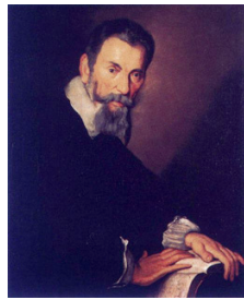
Claudio Monteverdi (1567 - 1643) Early Baroque