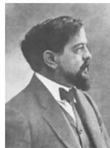
Claude Debussy (1862 - 1918) Impressionist