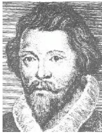
William Byrd (1543 - 1623) Renaissance