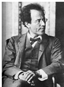
Gustav Mahler (1860 - 1911) Late Romantic