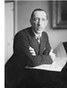
Igor Stravinsky (1882 - 1971) Modern