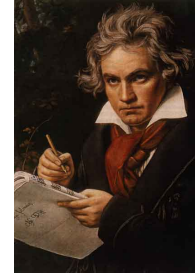
Ludwig van Beethoven (1770 - 1827) Classical